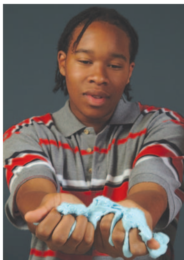
Slime made from borax and white glue shear thickens.